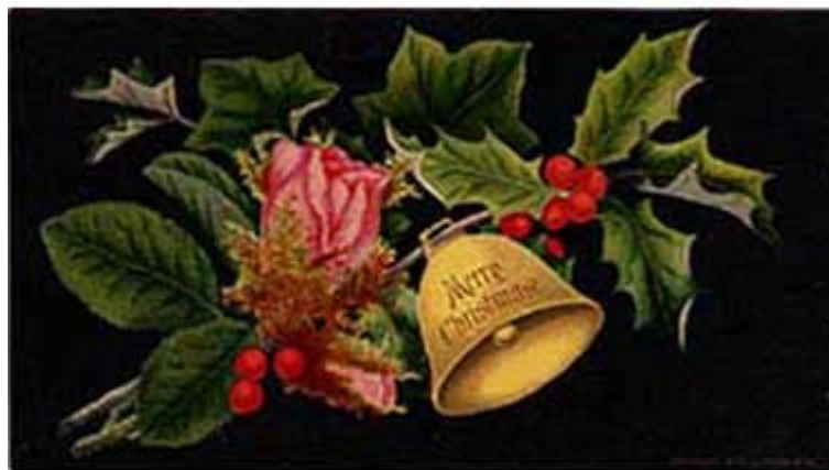
Louis Prang Card - 1876

By the 1850s, greeting cards had become much less expensive because of advances in printed as well as the introduction of the penny stamp in 1840 in England. Germany followed suit and soon greeting cards were being sent by the thousands and thousands all over Europe and beyond.